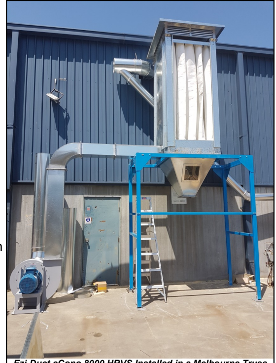
Ezi-Duct eCono 8000 HRVS Installed in a Melbourne Truss Manufacture . The customer is very happy with the units performance and simplicity of emptying the waste bin

As the customer produces a reasonable amount of woodworking waste they are very happy that all the